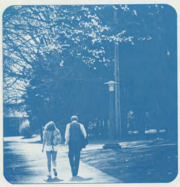
Pacific University obeys the letter and the spirit of all federal equal opportunity guidelines.