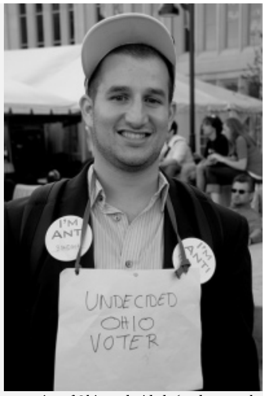
This fellow--though not representative of Ohio undecideds (and we can be glad for that!)--is among the targets of our mission. Study this chap and leave a comment with a suggestion for a message that might reach him. (Don't be too serious.)

If on this trip we're going to meet our Waterloo, let it be in Iowa , not Ohio. Eleven and a half hours on the road today, across South Dakota (a helluva lot wider than tall, dammit!), and into Iowa.