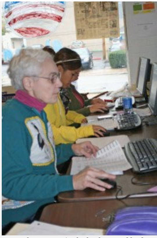
Obama's magnificent volunteers! The woman in the background had not worked in a campaign until this one.

Now the Richland County Democrats have a spiffy headquarters with a kitchen and dining area and full basement and they strut their stuff with an attractive green canopy on the front. They make money by renting the hall out to the community