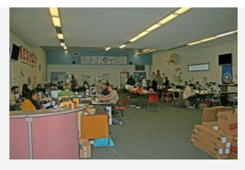
Obama's Ohio war room

We couldn't leave Columbus without paying a visit to the state Obama headquarters and thanking the surrogate schedulers who worked our ... rear ends ... off. (See their photo above.) The whole Ohio "war room" is in the basement of the Ohio Democratic Party building on Fulton Street, and you've not seen a more organized operation.