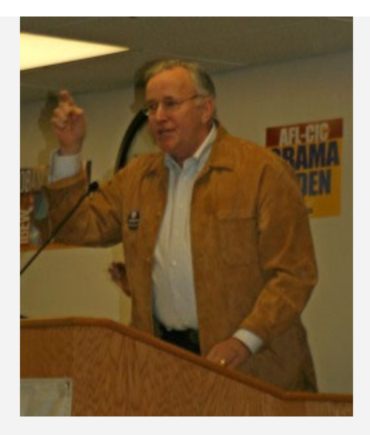
We're gonna toss out the horse thieves!

I started with the story of the union man who slips into a Republican meeting and repeatedly interrupts the emcee: "I'm a unionist and a Democrat! I'm a unionist and a Democrat!"