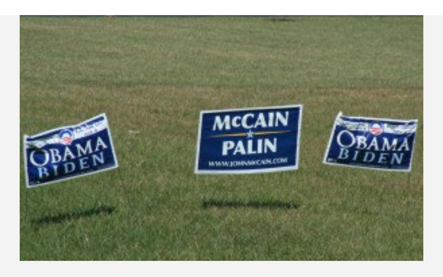
Two to one! Sounds right to us.

Success depends a lot on the energy you draw from the audience, which in turn often depends on the use of a couple of "claptraps" (i.e., guaranteed applause lines)—preferably funny and pointed—at the outset.