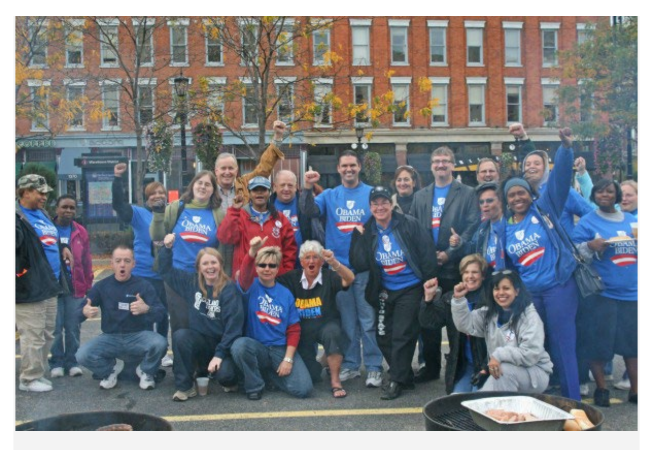
Spirited canvassers from the American Federation of Teachers

It was one of those days when a schedule goes screwy but improvisation makes it better than you planned. We were going to meet members of the American Federation of Teachers at their lunch break from a day of professional training and go on to a gathering of canvassers for Working America, an AFL-CIO affiliate.