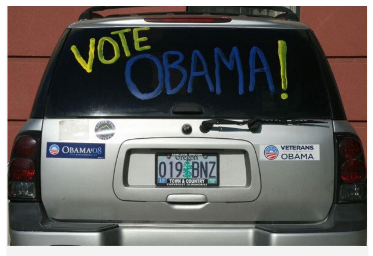
Messaging, 'til the last dog comes home

Our minds are on tomorrow as I write this during a punishing, eight-hour haul from Waterloo, Iowa, to South Dakota's capital. (They knew what they were talking when they named this the Great Plains; My god, it's endless!). It helps to have set off this morning knowing that Obama could lose every toss-up state (OH, MO, NC, IN, FL, NV and VA) and still take the big enchilada.