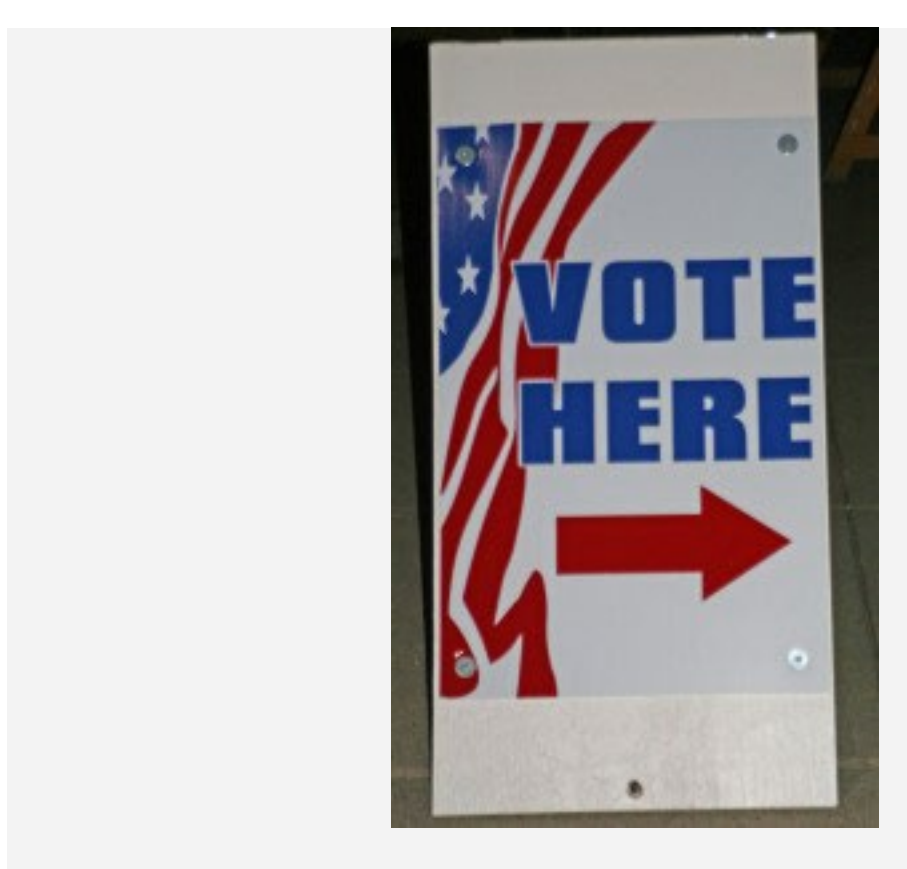
Yes, we did!

My political involvement began with black voter registration in Nashville, Tennessee, and fighting the electrical violence of lunch counter sit-ins.