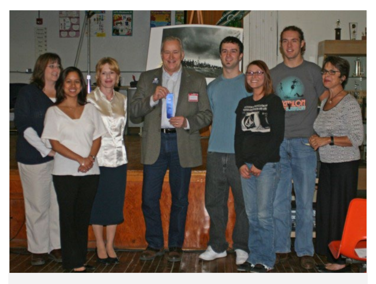
At Graham Digital Academy faculty and local residents, with a blue ribbon for GDA students: Who You Are Makes A Difference