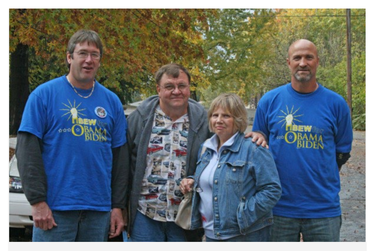
Proud members of the International Brotherhood of Electrical Workers, ready to canvass for Obama

But at last Saturday's Washington County dinner in Marietta, the sun, stars and moon seemed in alignment. I started having fun at the microphone and the crowd was having fun with me. If we were playing baseball, the ball would have cleared the upper deck—socked out of the park not just by my oratory but by fabulous candidates and hard-charging union and party volunteers, who have blood in their eye and intend to kick ... ankles ... next Tuesday.