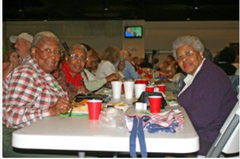
Sisters & Democrats to a one