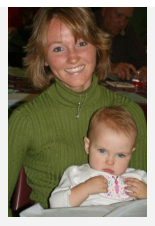
Mother holding what the election is all about

In Adams County, along the Kentucky border, a lot of Ohioans speak with a drawl, and it is red, red, red.