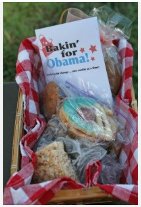
Bakin' for Obama: Working for change, one cookie at a time. By WORD (Women Openly Reclaiming Democracy)

bless him, said, "It's a right ." The god-given right of every American man, woman and child to have health care at least as good as John McCain gets as a U.S. senator.