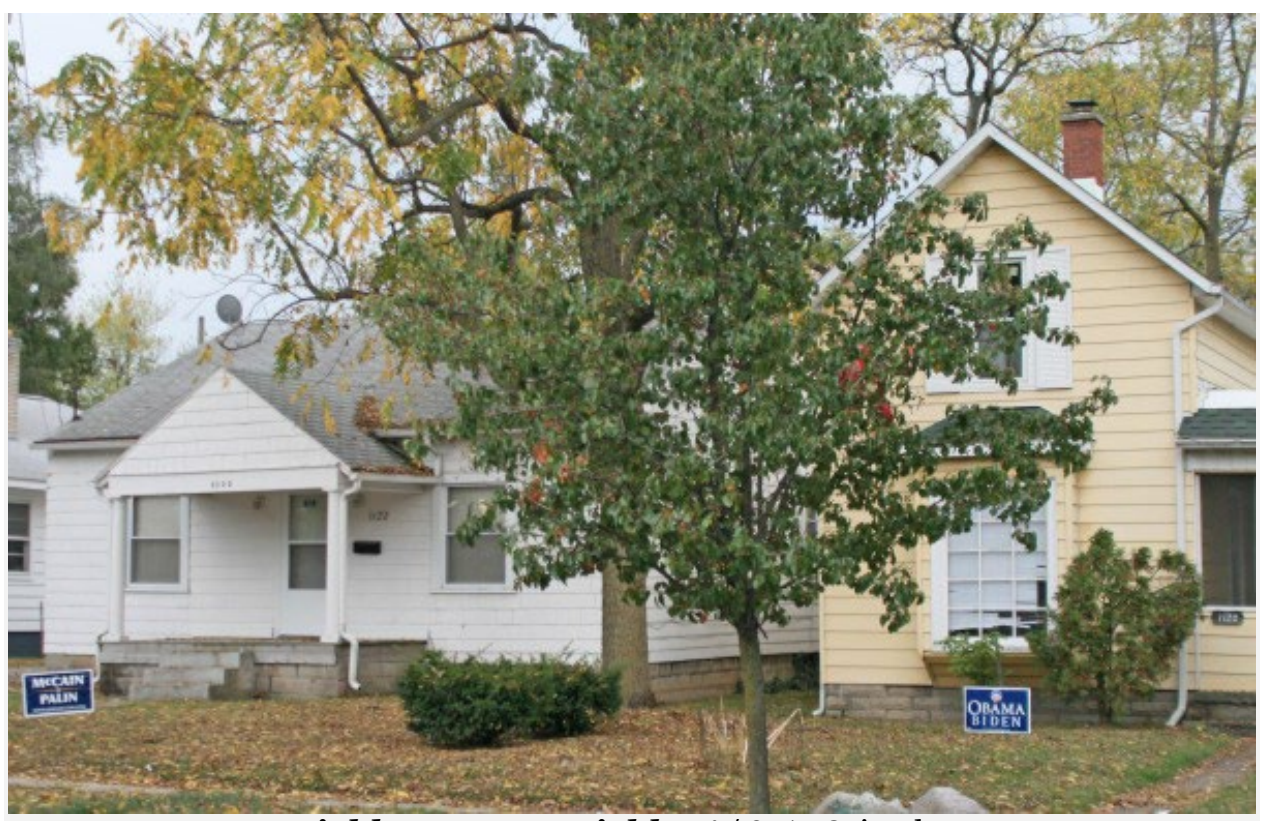
Neighbor versus neighbor!

Wednesday, Thursday and Friday were a blur, covering three cities from the central west to the east, the south, and back again to Columbus, our home base, in the center of the state.